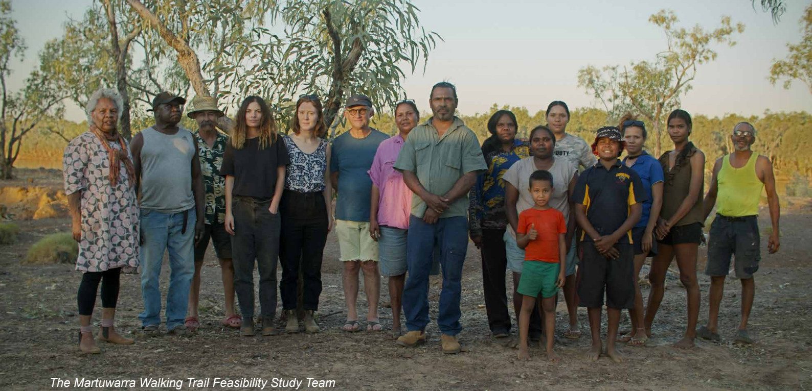
The Martuwarra Walking Trail Feasibility Study Team